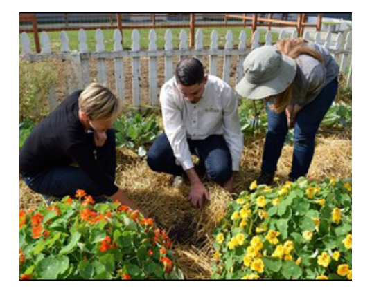
NRCS conservationist assisting small scale farmer with developing a customized conservation plan.

To file a program discrimination complaint, complete the USDA Program Discrimination Complaint Form, AD-3027, found online at How to File a Program Discrimination Complaint and at any USDA office or write a letter addressed to USDA and provide in the letter all of the information requested in the form. To request a copy of the complaint form, call (866) 632-9992. Submit your completed form or letter to USDA by: (1) mail: U.S. Department of Agriculture, Office of the Assistant Secretary for Civil Rights, 1400 Independence Avenue, SW, Washington, D.C. 20250-9410; (2) fax: (202) 690-7442; or (3) email: program.intake@usda.gov.