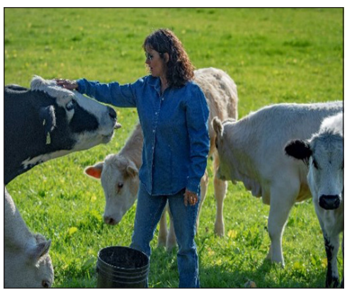
Clean dry animals do not smell as bad.