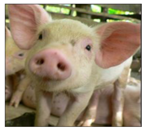
Dirty, manure-covered animals can help accelerate bacterial growth.