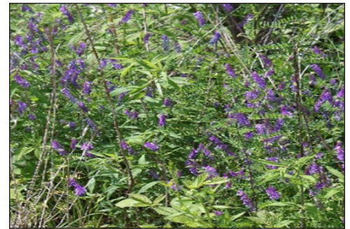
These may look like weeds, but to many wildlife species this would be a perfect place to find food, nest, raise young, escape from predators, or rest.