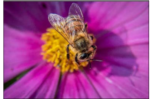
Natural areas provide supplemental food sources to all kinds of species.

Disking – Disc harrowing is a preferred method of disturbing the soil and vegetation. The only equipment needed is a tractor and disc harrow. The blades on the harrow should be set as straight as possible.