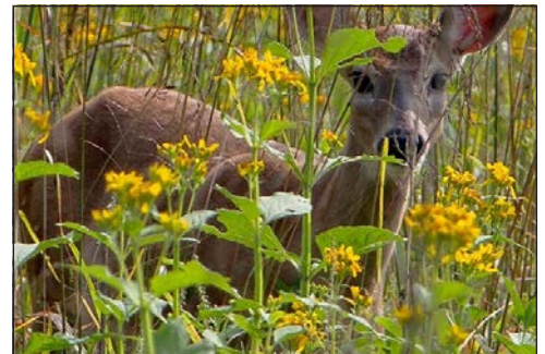
Blacktailed deer browsing on weeds growing in tall grass.